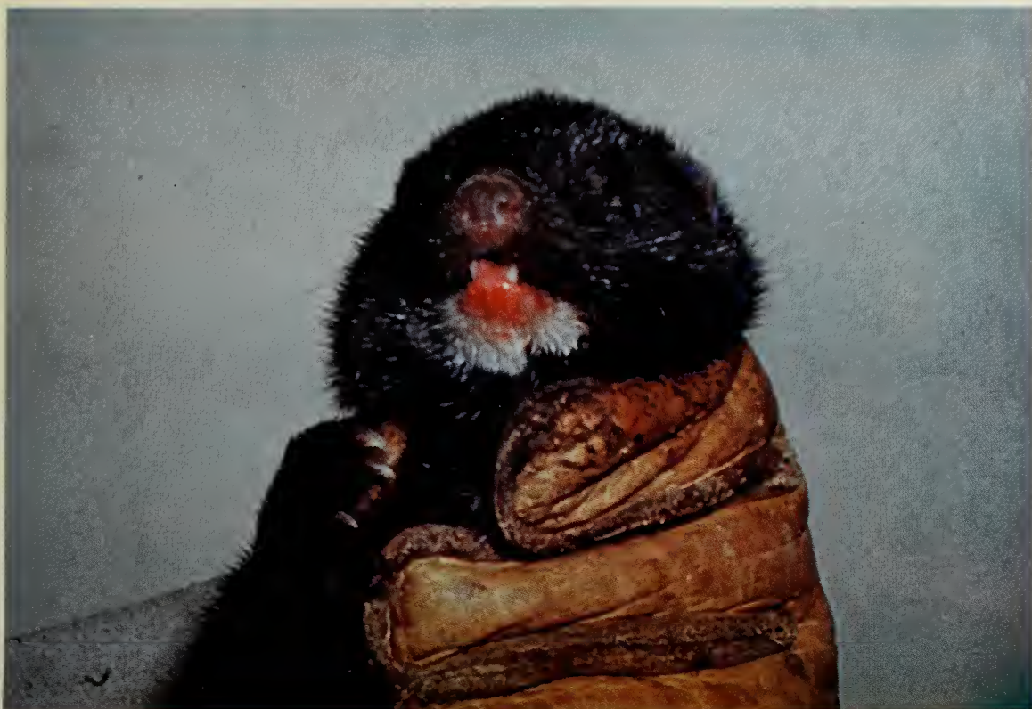
Fig. 5. Distemper — swelling and encrustation of nose.